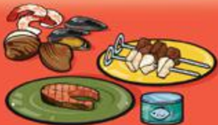
Cooked fish, shellfish, poultry, lean meat 75 g (2 ½ oz.)/125 mL (½ cup)