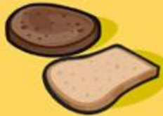
Bread 1 slice (35g)