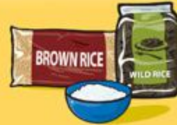
Cooked rice, bulgur or quinoa 125 mL (½ cup)