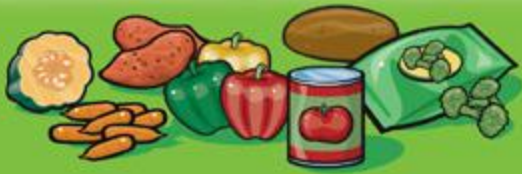
Fresh, frozen or canned vegetables 125 mL (½ cup)