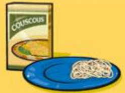
Cooked pasta or couscous 125 mL (½ cup)