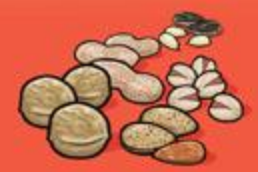
Shelled nuts and seeds 60 mL (¼ cup)