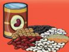
Cooked legumes 175 mL (¾ cup)