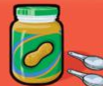
Peanut or nut butters 30 mL (2 Tbsp)