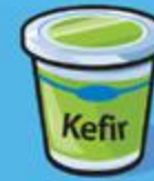
Kefir 175 g (¾ cup)