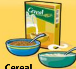
Cereal Cold: 30 g Hot: 175 mL (¾ cup)