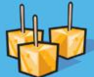
Cheese 50 g (1 ½ oz.)