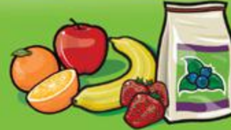
Fresh, frozen or canned fruits 1 fruit or 125 mL (½ cup)