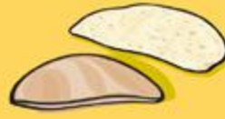
Flat breads ½ pita or ½ tortilla (35 g)