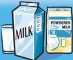
Milk or powdered milk (reconstituted) 250 mL (1 cup)