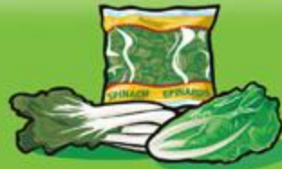
Leafy vegetables Cooked: 125 mL (½ cup) Raw: 250 mL (1 cup)