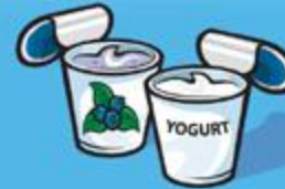
Yogurt 175 g (¾ cup)